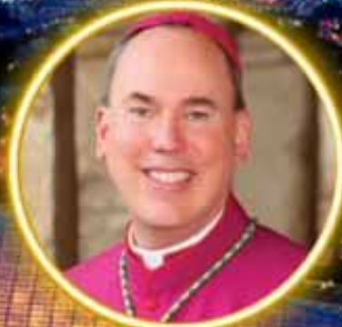
OBISPO TIMOTHY FREYER